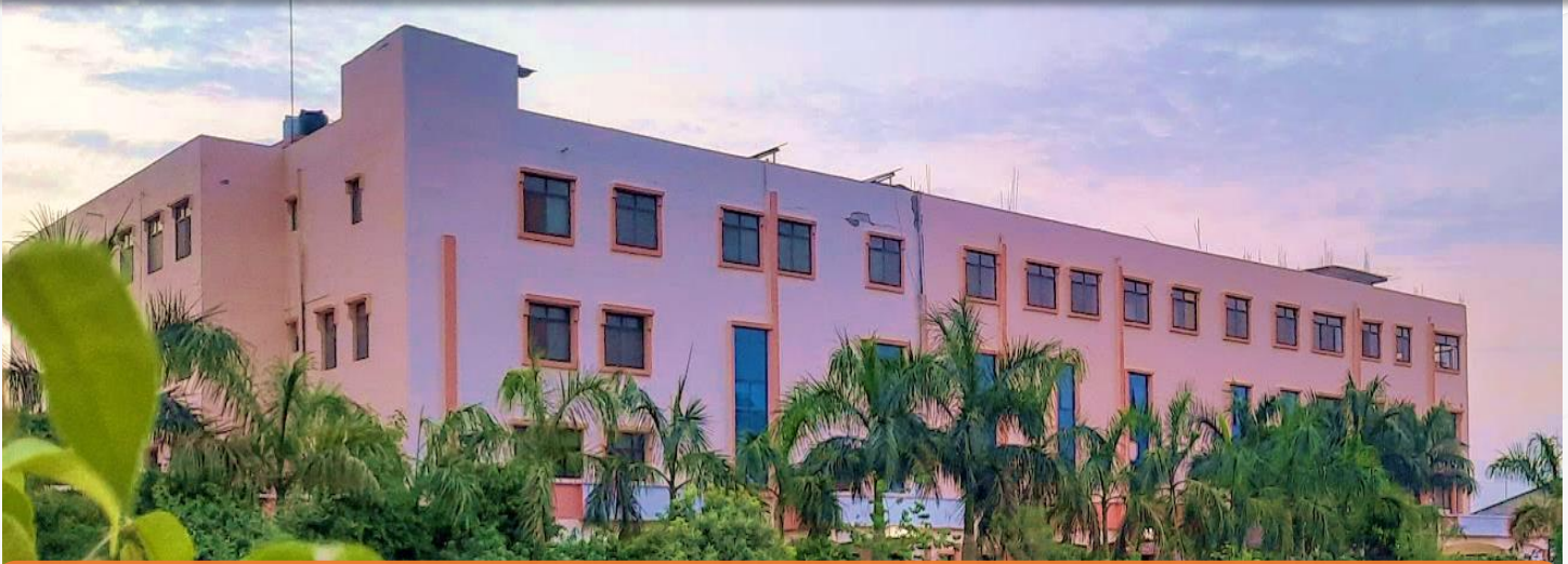
SAMARPAN INSTITUTE OF NURSING & PARAMEDICAL SCIENCES

Marking a decade of educational excellence