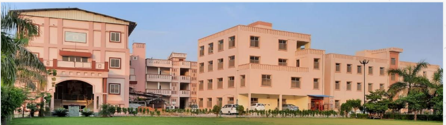
SAMARPAN COLLEGE OF PHARMACY